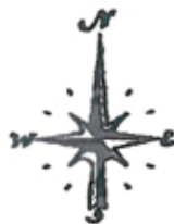
EXHIBIT "B" PROPERTY SETBACKS 1" = 400'